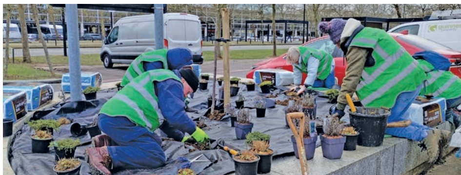
◀ CMK Green Gym maintaining planters in CMK

We'll keep you updated as the work progresses.