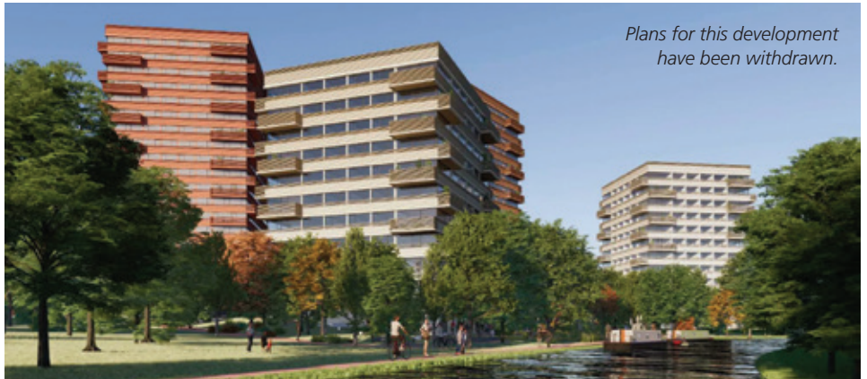
Plans for this development have been withdrawn.

Developers behind Campbell Park Northside withdrew their planning application seeking to build hundreds of flats on land opposite the canal. Separately, developers had lodged a planning application to build a 33-storey tower in replacement of the old Jaipur restaurant, consisting of 300 flats and some commercial units. This scheme was refused by the City Council in December, citing many issues we raised in our objection.