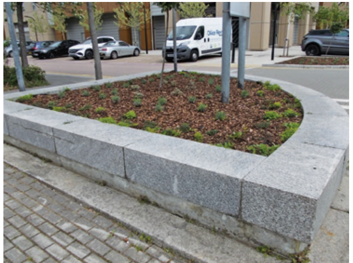
▲ Newly-planted quadrant

Currently, some of the quadrants that were replanted prior to lockdown are in need of maintenance work. We have asked CMK Green Gym, which the Town Council supports, to start clearing some of the beds of weeds and unwanted growth (see images below). CMK Green Gym's volunteers do a brilliant job at maintaining green spaces across CMK (they work regularly to keep Fred Roche Gardens looking great), and we hope that this work will continue during the summer months. If you want to help maintain the planters, and assist with other works, you can contact the Green Gym at cmkgreengym@gmail.com