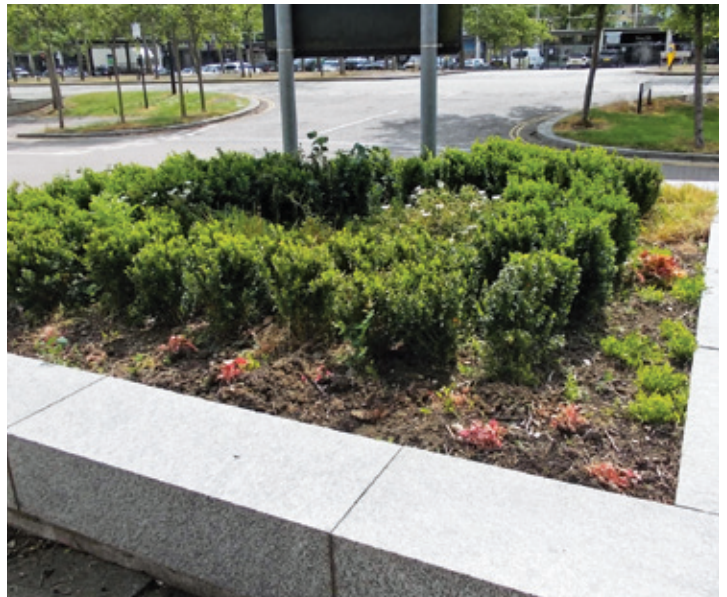
◀ From this... to this ▲