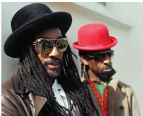
▲ Aswad - ready to reggae!

World-class reggae acts, including Aswad, Maxi Priest and The Maytals Band, will be performing at a family-friendly event in Campbell Park on Saturday 14th August.