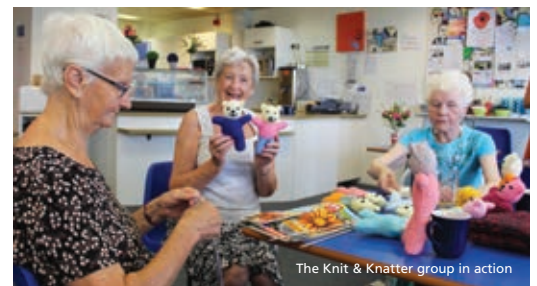
The Knit & Knatter group in action

Visit www.ageukmiltonkeynes.org.uk for more details, or pop in at The Food Centre, 791 Avebury Boulevard, CMK.