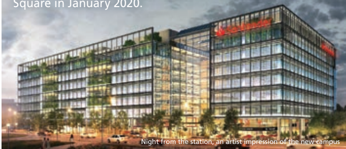
Night from the station, an artist impression of the new campus

Construction is expected to begin on the site near Station Square in January 2020.