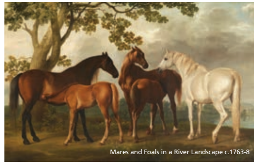
Mares and Foals in a River Landscape c.1763-8

Technically brilliant, yet sympathetic to his subjects, the work of one of the UK's greatest animal artists is currently on show at Milton Keynes Gallery.