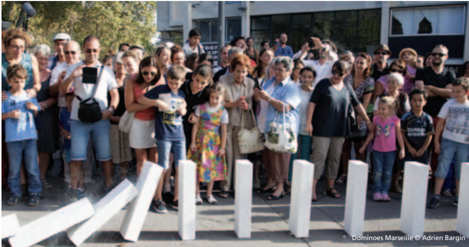
Dominoes Marseille

The spectacular International Festival returns to CMK this year, running from 15-24 July. The festival features events and performances throughout the city, as well as a video project to recreate scenes from Superman IV, which was filmed in CMK in 1986.