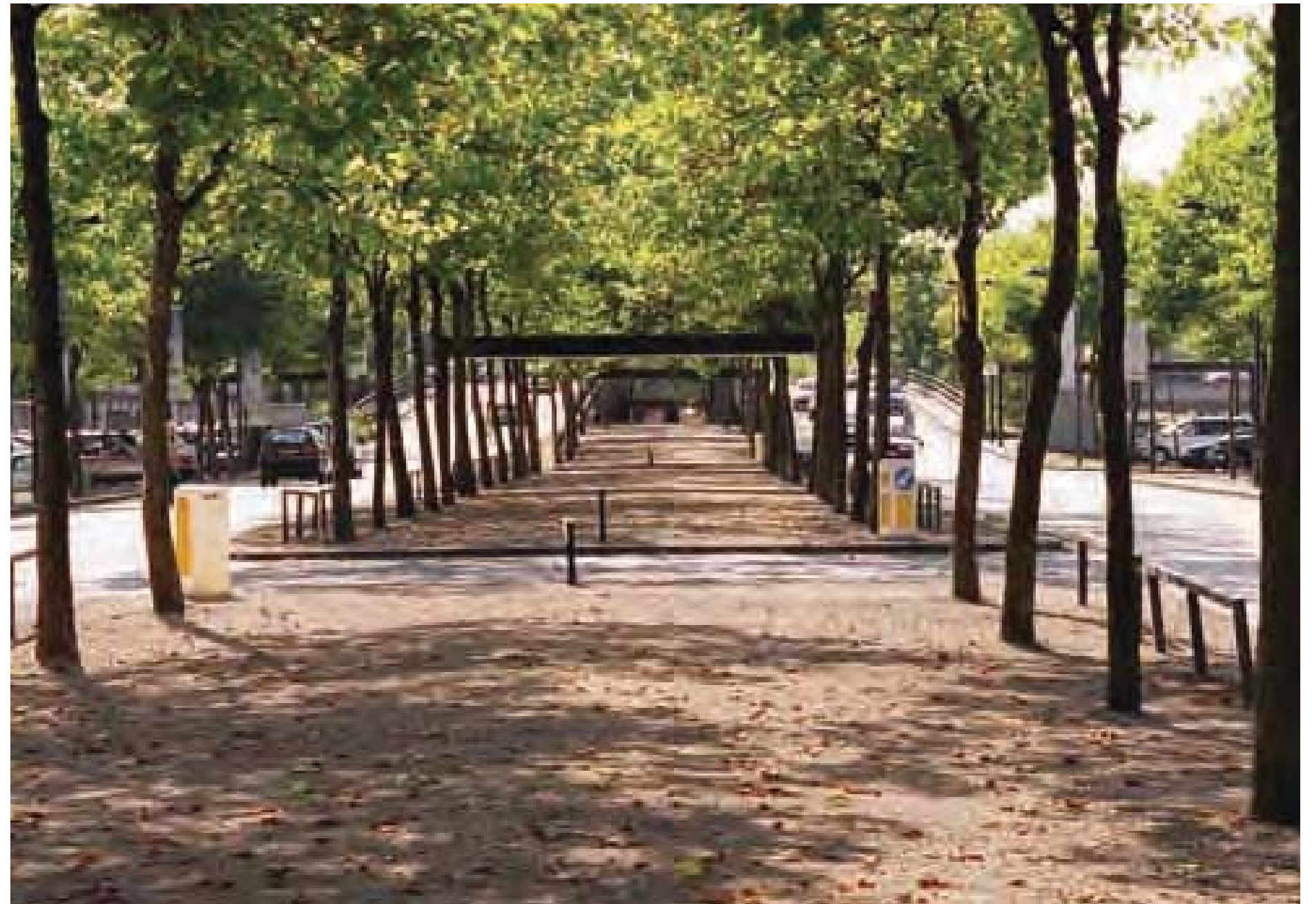
London Planes line CMK's Boulevards. Porte cocheres provide weather protection for pedestrians