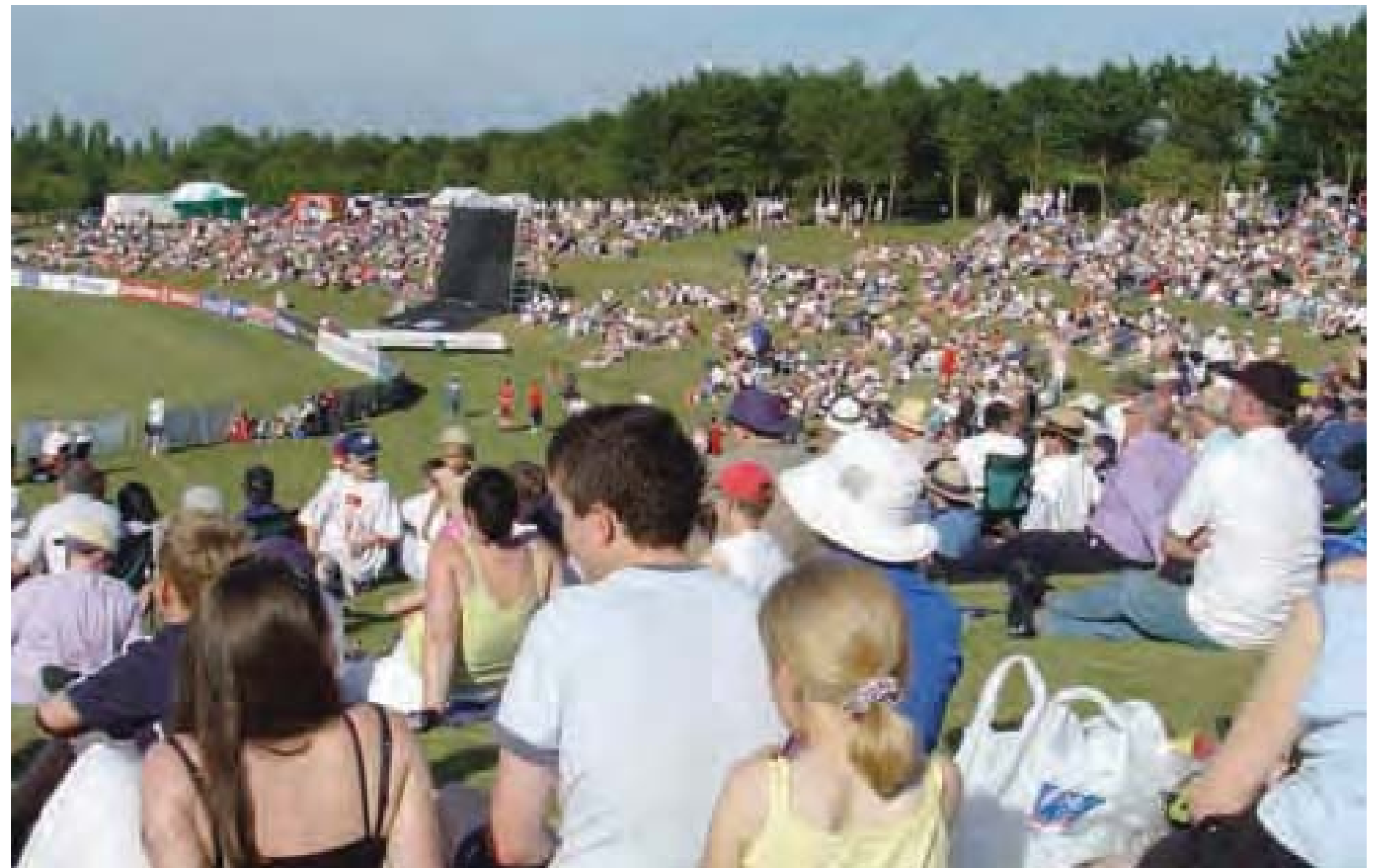
Stunning Campbell Park on the eastern end of the city centre