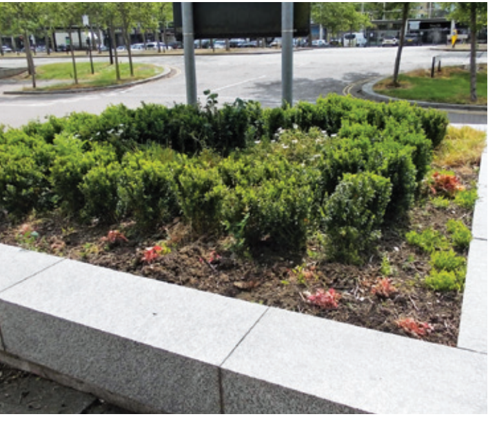
From this... to this 🛕