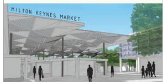
Above: 3d modelling of the market and canopy - proposed view from the shopping centre

Look out for the open consultation inviting residents to comment on the plans for this space.