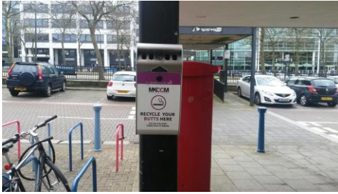
Above: New butt bin outside Acorn House Midsummer.

not being disposed of correctly in certain areas, it has been highlighted to building facilities managers who issue internal emails to their staff reminding of the need to use the bins provided.