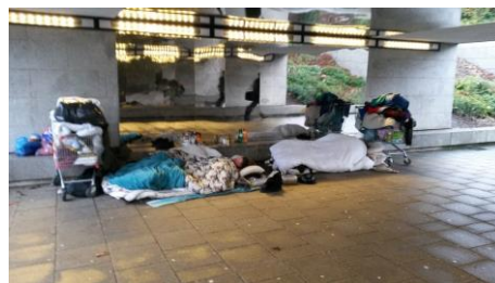
Above left and right: Items which were removed from the rear of Currys. The person had vacated the tent and moved to a new area. Items abandoned leaving a major security risk, near the Job Centre Midsummer Boulevard.