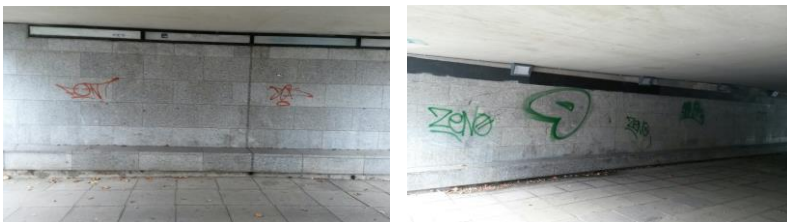
Above: Graffiti at underpass near Station Square.

These jobs were logged at various dates across January 2016. Most of these are small tags normally, but lately larger tags have been visible. See picture below. Some tags are marker pen sized. Please note a graffiti tag is the offender's personalised signature.