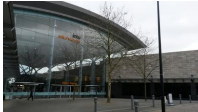
Above left: Branch for removal on North Row. Above right: Trees pruned front Intu Midsummer.