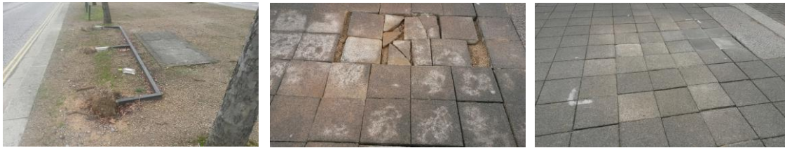
Above left: Road barriers Jurys Inn. Centre: Before Medina path. Above: Medina path repaired.