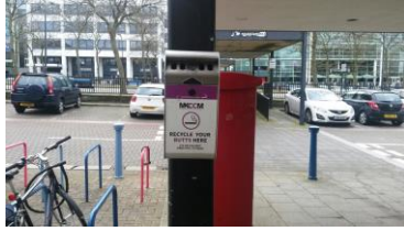
Above: Butt Bin Acorn House.

the criminal damage to around 25 bins, members of the public don't walk to another nearby bin if the one that they normally use is out of action, this causes more litter on the floor. No fixed penalty notices have been issued in September. If there are issues of cigarettes not being disposed of correctly in certain areas, it has been highlighted to building facilities managers who issue internal emails to their staff reminding of the need to use the bins provided.