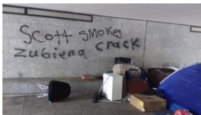
Above: Jury's Inn Midsummer.

These jobs were logged at various dates during September most of these are smaller tags normally, but lately larger tags have been visible. See pictures below. Some tags are marker pen sized. Please note a graffiti tag is the offender's personalised signature. 5 jobs are outstanding due to rough sleepers in the way, and Serco staff being threatened and unable to carry out normal duties.