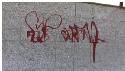
Above: Jaipur Location.