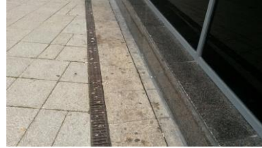
Above: Litter in Midsummer.