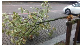
Above: Outside Acorn House.