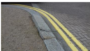
Above: Station Square.