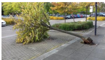
Above: Near Travel Lodge.