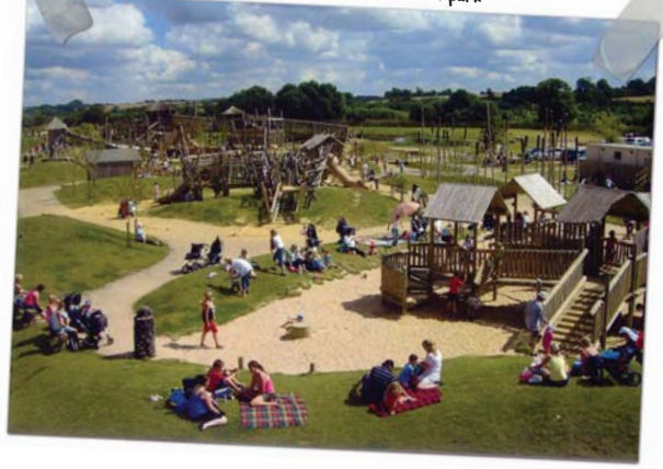
Stanwick Lakes - Northamptonshire destination park

...but we'll also include some key pieces to make Campbell Park the best destination in the region