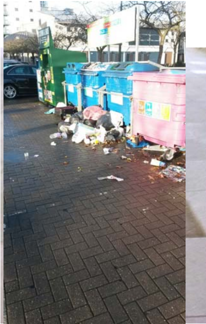
Above left: Recycling bank at Upper 12 th Street which needs attention. Above centre: Pathway outside The Buszy pre repair. Above right: Pathway outside The Buszy following repair.