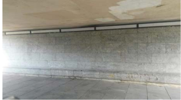
Above left: Graffiti on underpass near Elder Gate. Above right: Underpass near Elder Gate following graffiti removal.